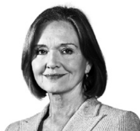
Anna Ford ♦ * ♥